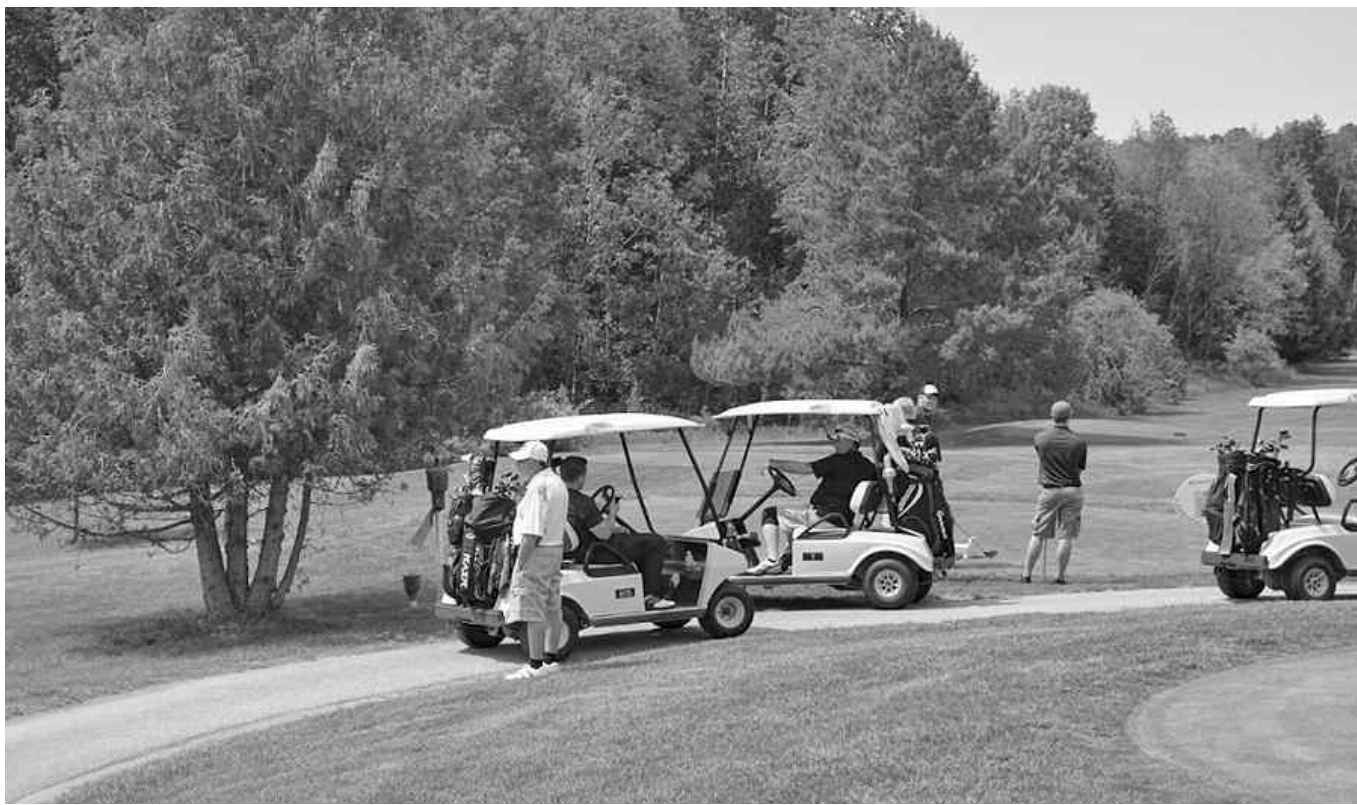
The 20th Annual East Jordan Area Chamber of Commerce Spring Golf Outing will be held Friday, June 2nd at the Mallard Golf Club located at 9569 Bailey Road in East Jordan.