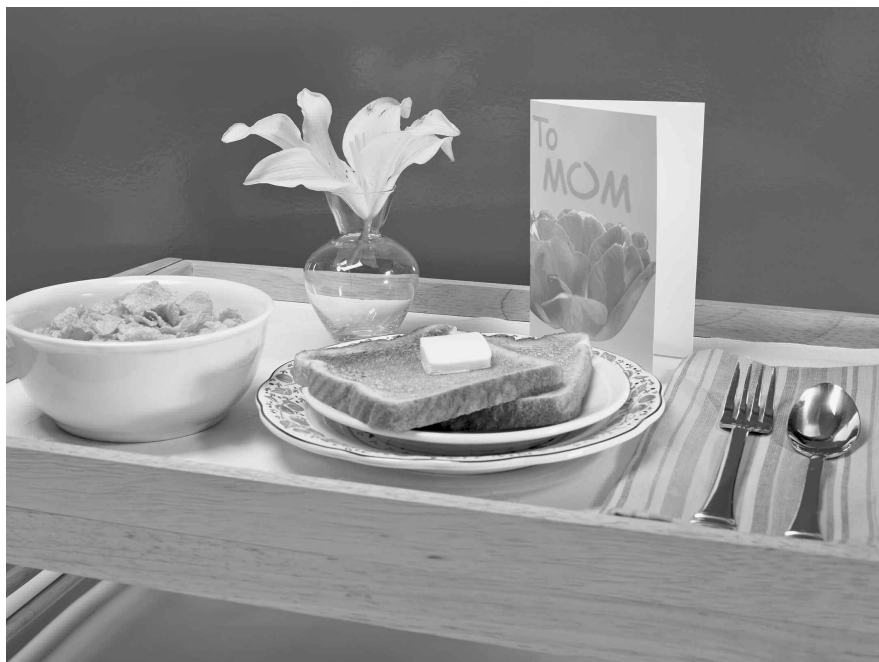
The greatest gift a child can give is letting their mother know that they love them too. FILE PHOTO

Some Mother's Day trivia; - The oldest woman to deliver a child is said to be Omkari Panway, who gave birth to twins in 2008 when she was 70 years old. - Southern Californian Nadya Sule-