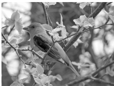
The Petoskey Regional Audubon Society (PRAS) invites the public each Tuesday and Thursday in May for free early morning bird walks and also on Wednesdays evenings in May (Scarlet Tanager shown here).

The Petoskey Regional Audubon Society (PRAS) invites the public each Tuesday and Thursday in May for free early morning bird walks and also on Wednesdays evenings in May to share the wonders of spring migration throughout the month. Each week should offer a different selection of species as new migrants arrive. These leisurely walks are appropriate for all levels of birding experience, and no reservations are required.